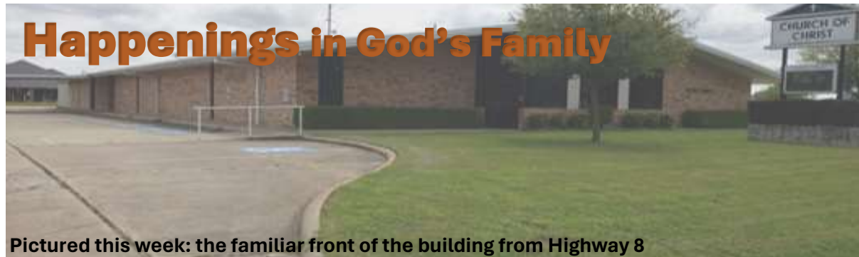
Pictured this week: the familiar front of the building from Highway 8

See that ye refuse not him that speaketh. For if they escaped not who refused him that spake on earth, much more shall not we escape, if we turn away from him that speaketh from heaven: Whose voice then shook the earth: but now he hath promised, saying, Yet once more I shake not the earth only, but also heaven. And this word, Yet once more, signifieth the removing of those things that are shaken, as of things that are made, that those things which cannot be shaken may remain. (Heb 12:25-27)